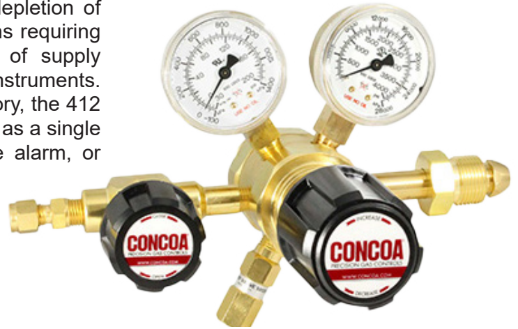
412 3331-01-580 shown